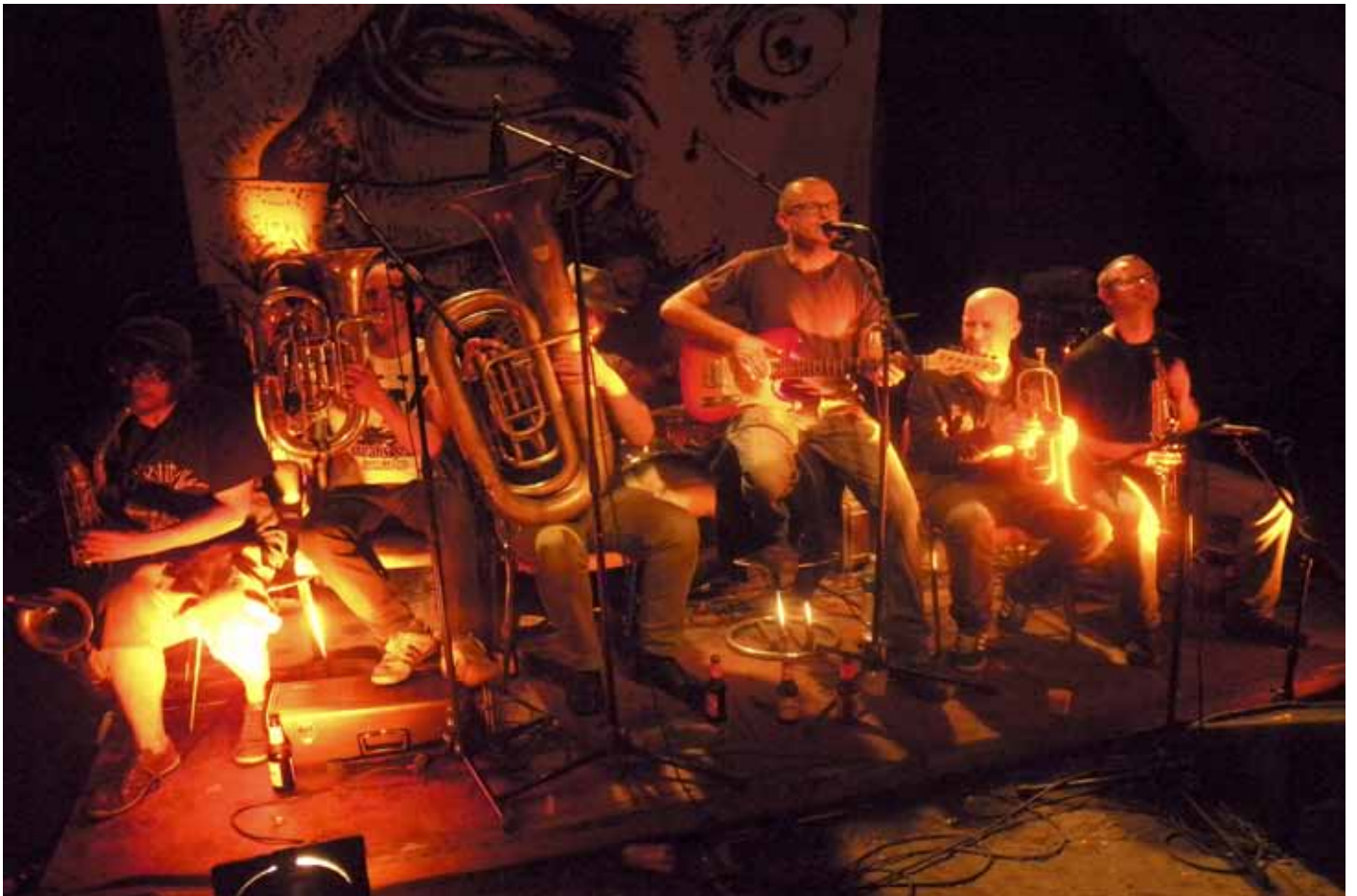
«The Freaks Show renewed the assault of Europe » Le Quotidien Jurassien , Juiln 2013